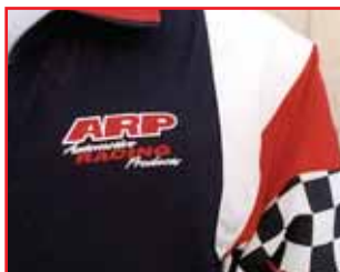
CHECKERED FLAG JACKET

Our T-shirts are heavy-duty 100% cotton and built to last! Adult sizes are available in three popular colors: white, sand and ash while childrens sizes are available in white, orange and ash. On the back is a large silk-screened full-color graphic with a "blueprint" theme and a small Automotive Racing Products logo is screened on the front. ARP T-shirts are available in sizes Small to XXXL for adults and Small (6-8), Medium (10-12) and Large (14-16) for children. Please state sizes when ordering.