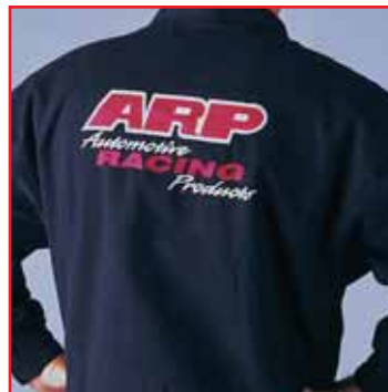
BLACK RACING JACKET

Take your pick from the traditional black suede-like material or new "checkered flag" motif. There's a full nylon lining with a handy zippered pocket. A heavy-duty metal zipper provides closure, while an elastic waistband and cuffs, plus generous side pockets, round out the technical features. Graphically, there's a large ARP logo embroidered on the back and a smaller version in front. The jackets are available in sizes M to XXXL.